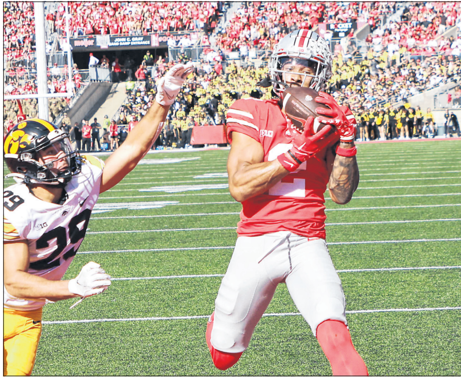
Emeka Egbuka, shown here making a catch against Iowa last season at Ohio Stadium, and Marvin Harrison Jr. give Ohio State possibly the best pair of receivers in college football.

there and I'm drawing two defenders I'm doing my part in the game. I might not have 100 yards (receiving) or the touchdowns that may be expected of me. But if I'm impacting the game by drawing two defenders and getting other receivers one on ones then I'm doing my part. That's kind of how I look at it," he said at the Big Ten Football Media Days.