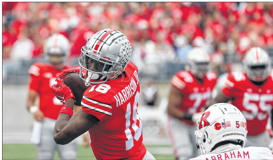
One of Ohio State wide receiver Marvin Harrison Jr.'s many skills is his ability to bend, stretch and twist better than most receivers, which this catch against Rutgers last season illustrates.

While there was a trip to the playoff, for the second year in a row there was no Big Ten championship and there was no win over Michigan. And last season's Michigan game and the 42-41 loss to Georgia in the playoff semifinal both highlighted OSU's season-long struggle to defend against big plays.